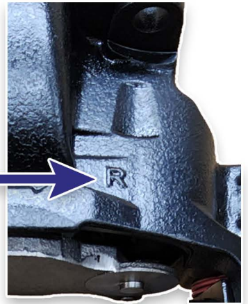
Look for the Letter R