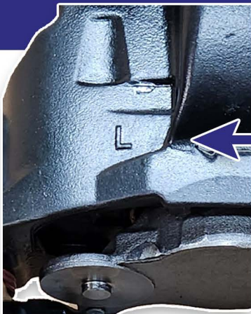
Look for the Letter L